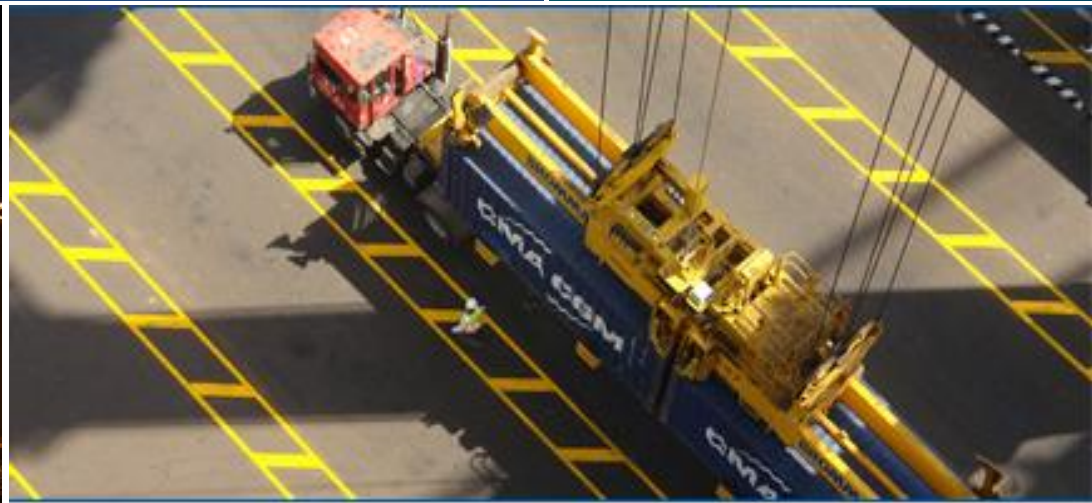
Djibouti DCT terminal