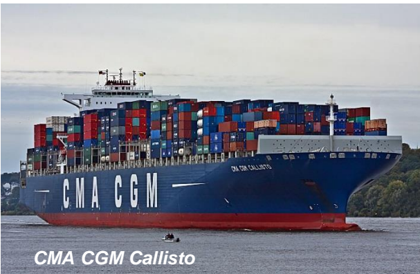
CMA CGM Callisto